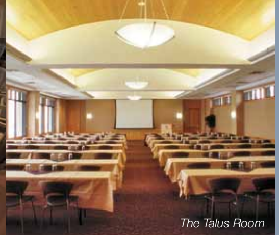
The Talus Room