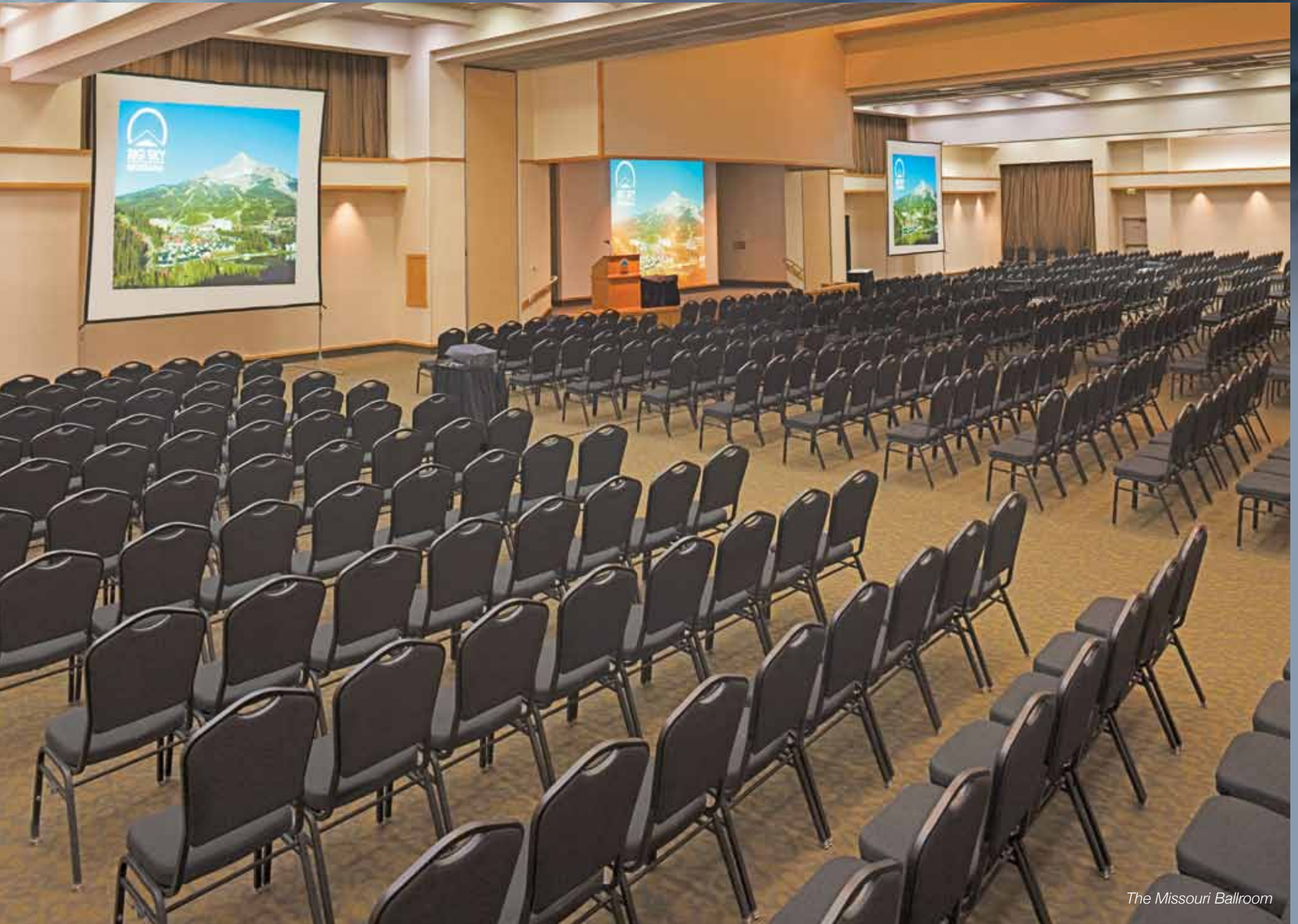
The Missouri Ballroom